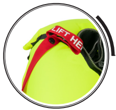
HIGHLY VISIBLE RED LIFTING STRAP