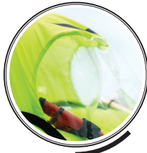
STRUCTURED SPRAY HOOD FITTED