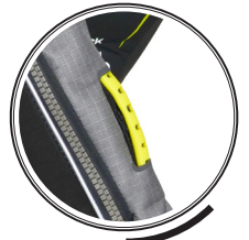
RECESSED MANUAL ACTIVATION HANDLE