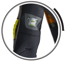
INDICATOR WINDOW ON REAR