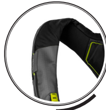
SHOULDER FIT SYSTEM, SITS ON SHOULDERS FOR A COMFORTABLE FIT