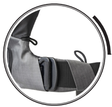
CHEST PACK ATTACHMENT POINTS