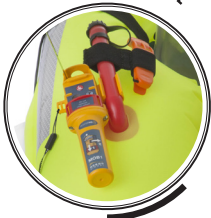
AIS MOB1 UNIT