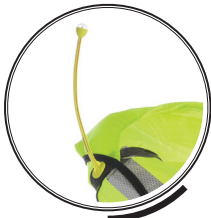
PYLON™ LIFEJACKET LIGHT FITTED (SOLAS APPROVED)