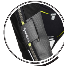
COVERED QUICK-BURST ZIP