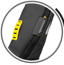
QUICK BURST ZIP & INDICATOR WINDOW