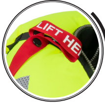
HIGHLY VISIBLE RED LIFTING STRAP