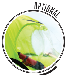
OPTIONAL SPRAY HOOD