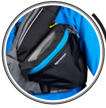
CHEST PACK ATTACHMENT POINTS