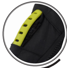
MANUAL ACTIVATION HANDLE