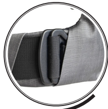
SMOOTH BODY ADJUSTER SYSTEM