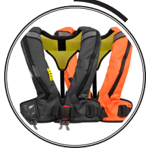
EXTRA DURABLE COVER MATERIALS