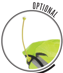
OPTIONAL PYLON™ LIFEJACKET LIGHT