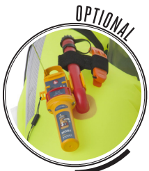
OPTIONAL AIS MOB1 UNIT